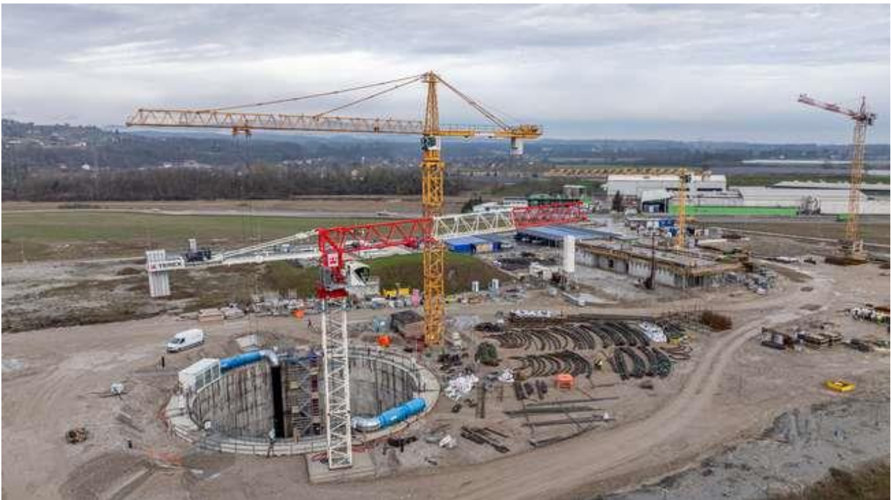
Figure 3: construction of the secondary wall

The construction of Phase 2 represents the most extensive part of the project, as it includes the excavation of the primary lining, the excavation of the silo, and the construction of the floor slab and secondary lining with all associated works. It also comprises the construction of the technological building, the administrative building and the installation of a hall above the silo, which will be the only montage steel structure. The completion of the works is planned for the second half of 2027.