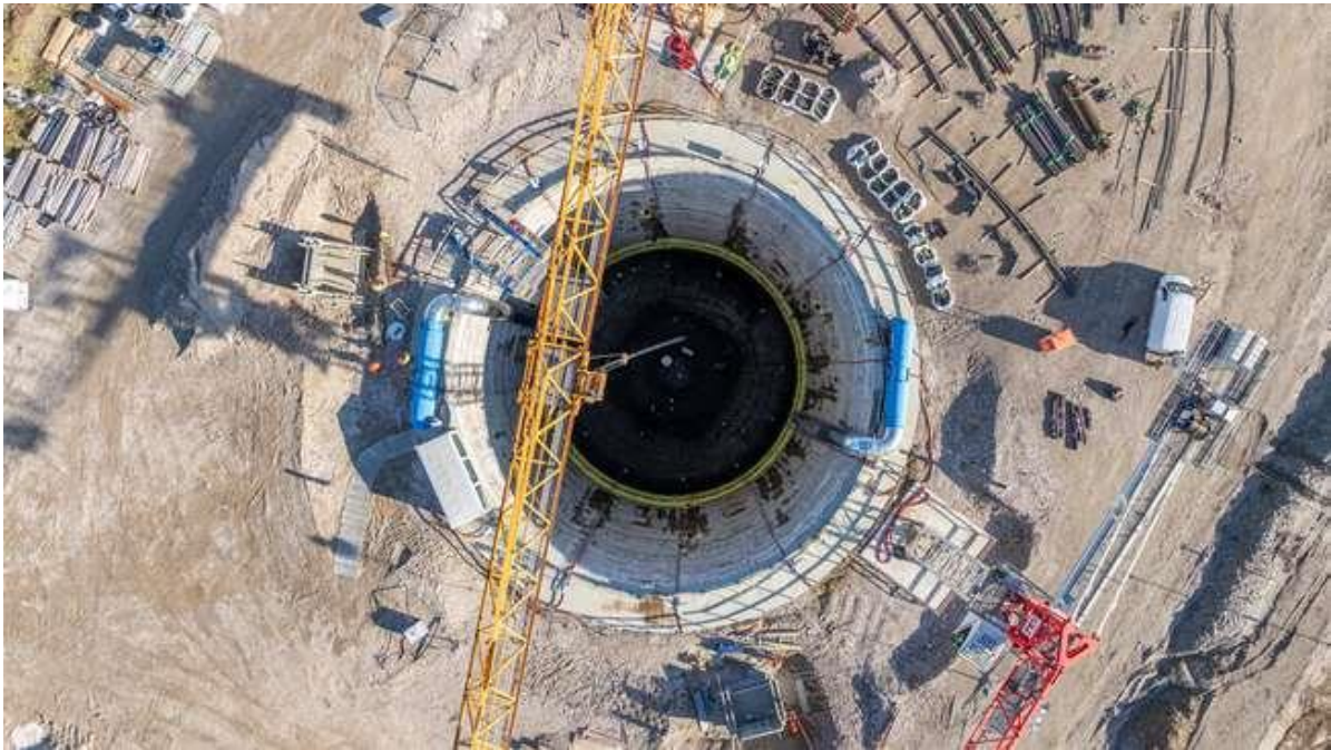
Figure 4: construction of the floor slab

The silo is near surface construction dimensions of 27,3 m diameter and 56 m depth to the bottom slab. The thickness of the primary wall is 1,5 m and secondary wall 1 m. The primary wall is deep 66m and it's made from 10 primary and 10 secondary panels. When the primary wall was finished became excavation of the silo. Week cycle of digging was 3m, after 5 th cycle they reduced to 2,5m per week. The material was excavated with two excavators and was transported to the surface with crane. On the bottom of silo is a concave shaped floor slab which measure 7 m in its thickest part. In slab is a tunnel and pool for technological wastewater.