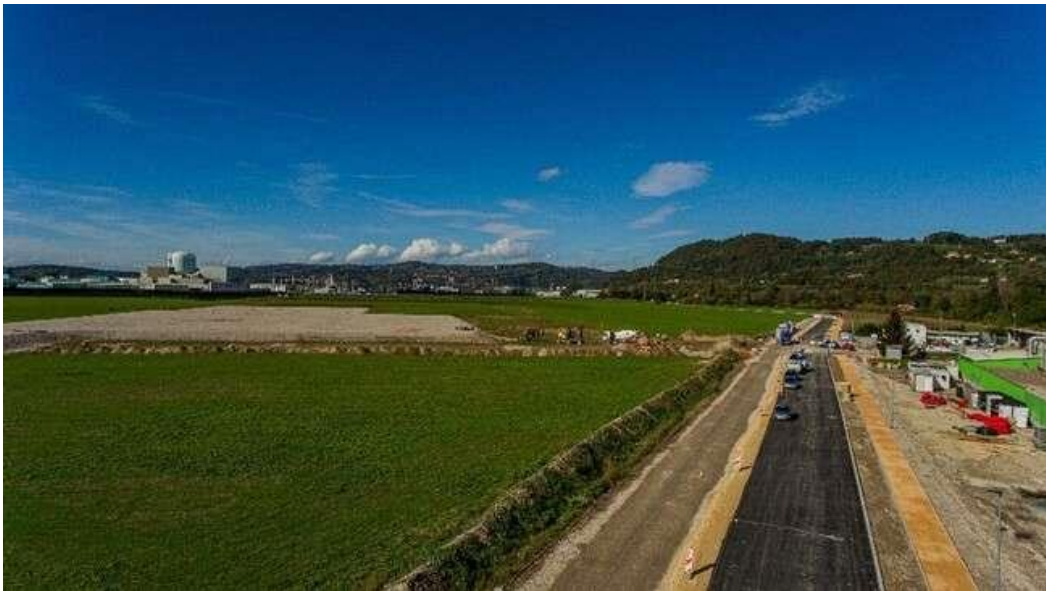
Figure 2: construction of phase 1