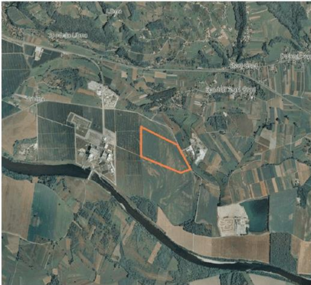
Figure 1: Location of LILW repository